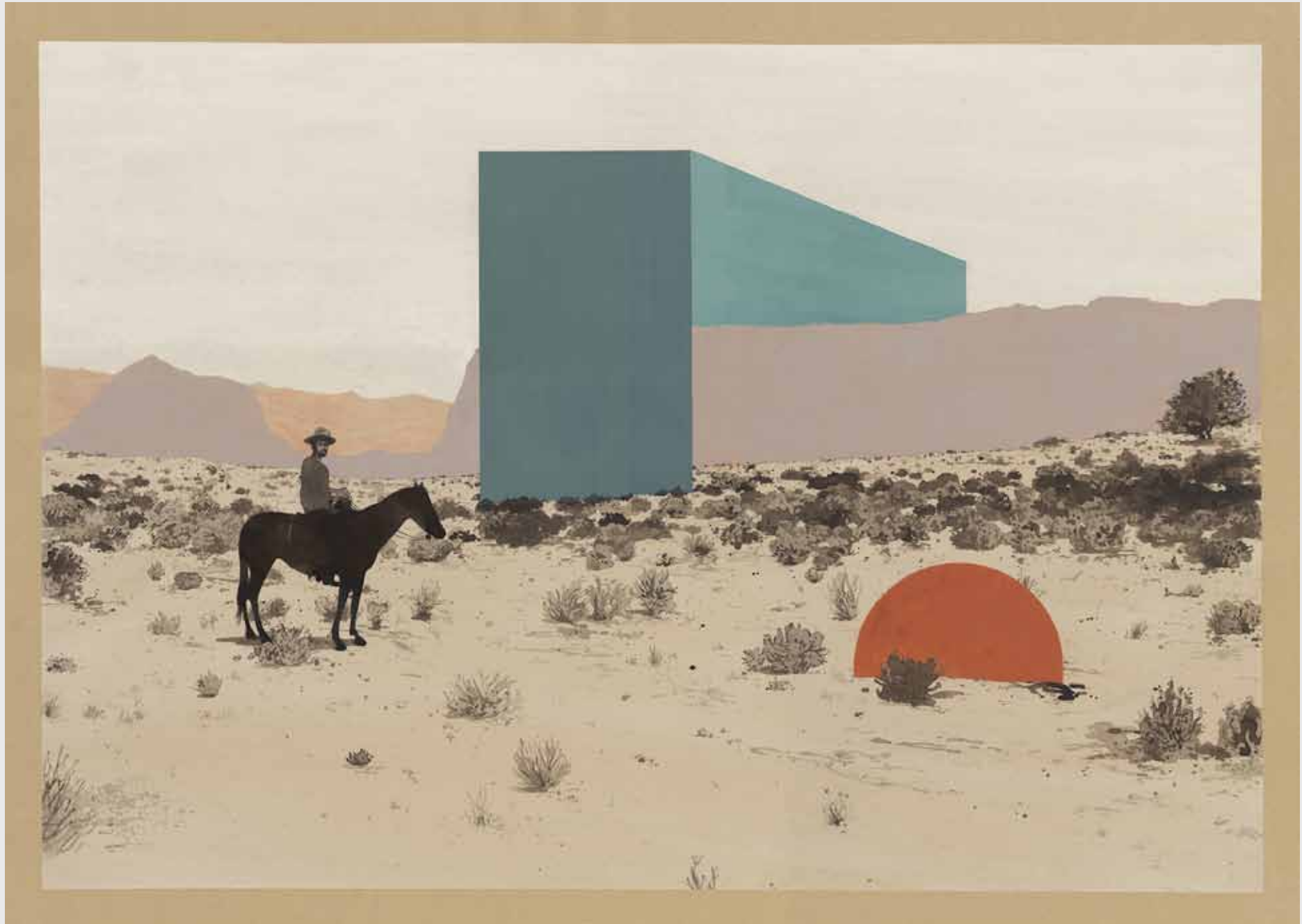
Range Rider , 2015, acrylic and gouache on paper, 50cm x 70cm