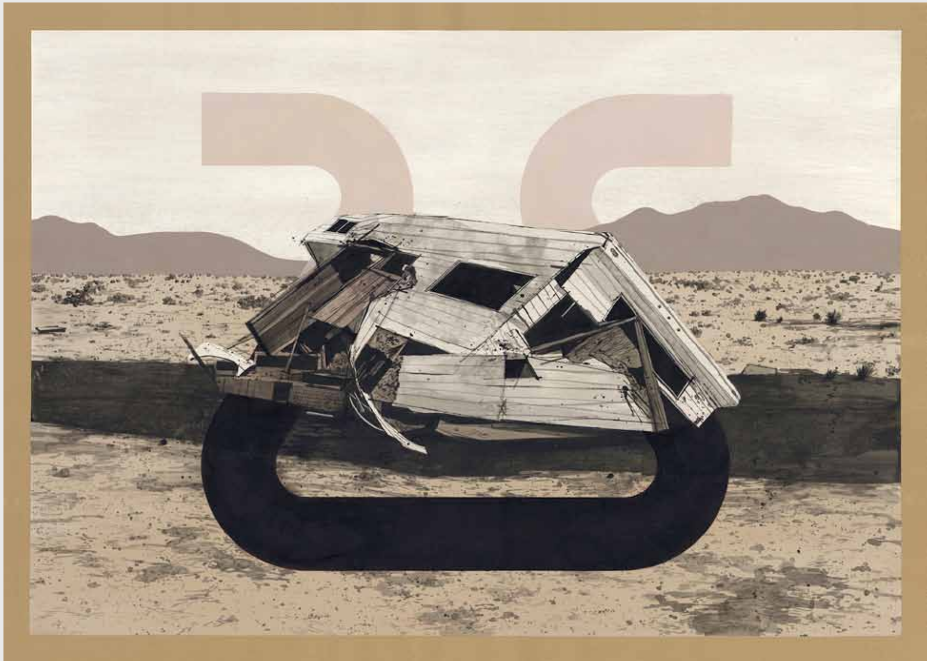
Desert Family Home , 2015, acrylic and gouache on paper, 50cm x 70cm