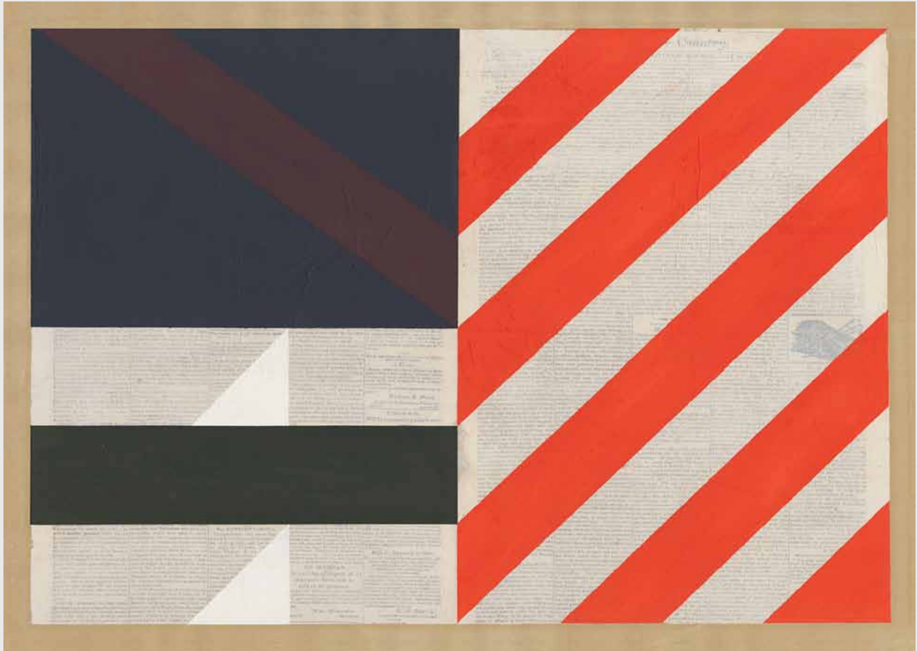
Flag of Contradictions , 2015, gouache and acrylic on vintage newspaper, 50cm x 70cm