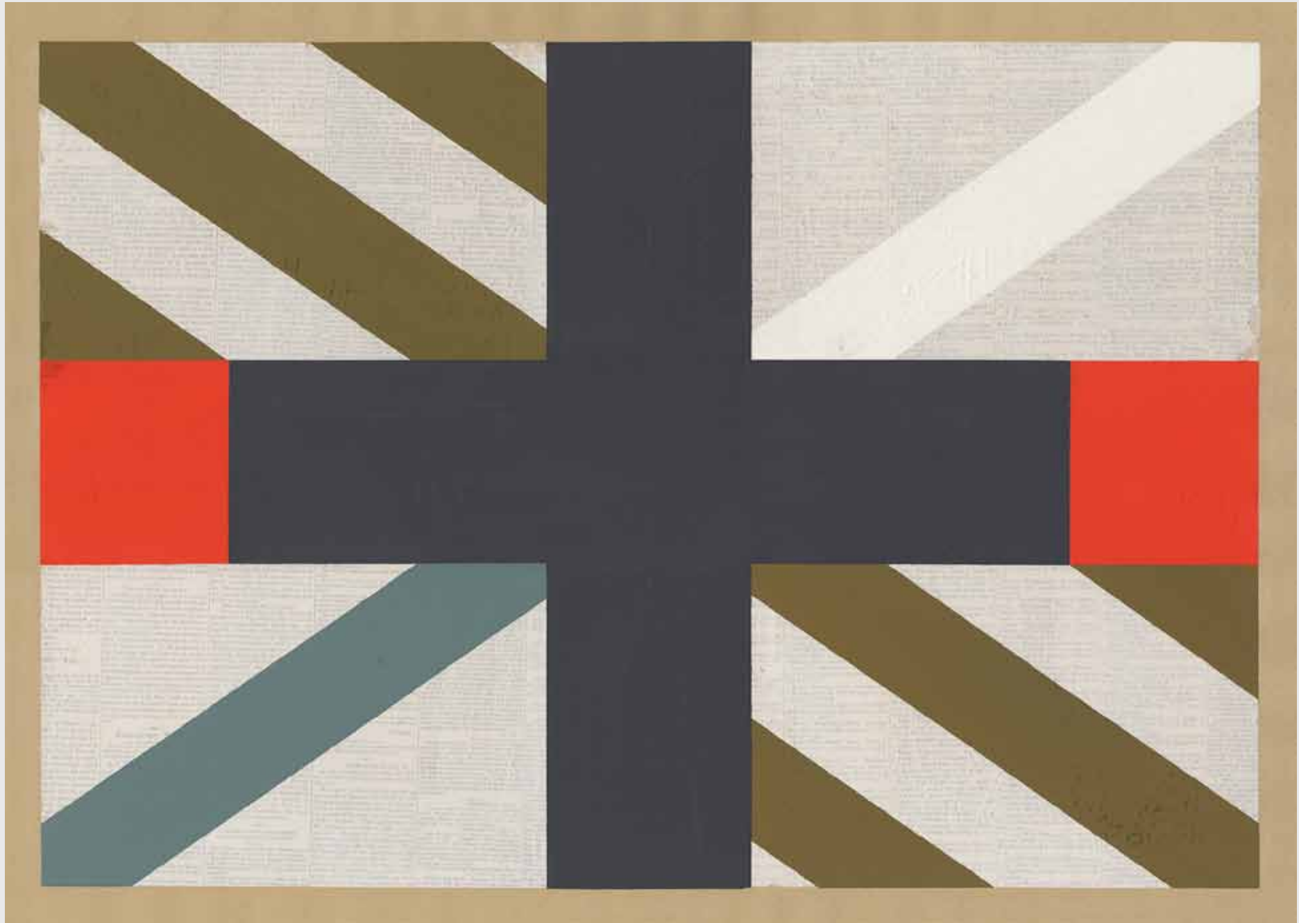
Cross Flag , 2015, gouache and acrylic on vintage newspaper, 50cm x 70cm