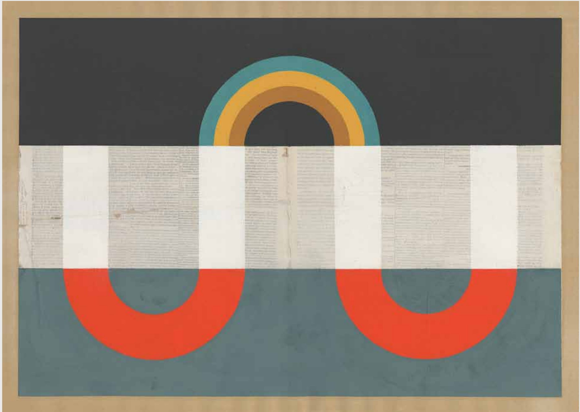
Community Flag , 2015, gouache and acrylic on vintage newspaper, 50cm x 70cm