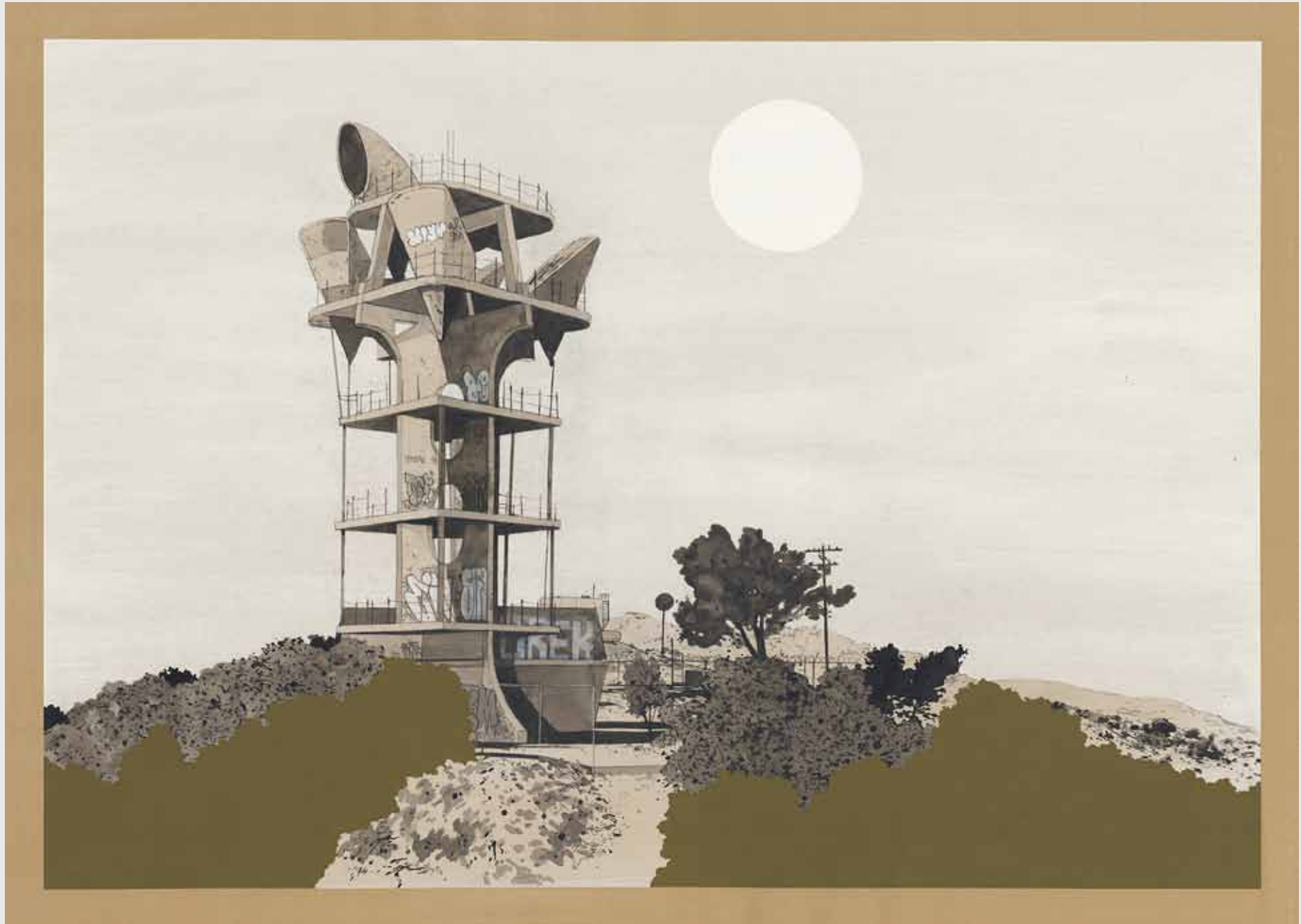
Topanga Tower , 2015, acrylic and gouache on paper, 50cm x 70cm