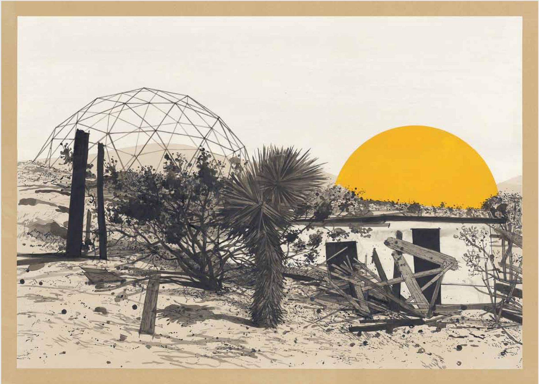
Desert Dome , 2015, acrylic and gouache on paper, 50cm x 70cm