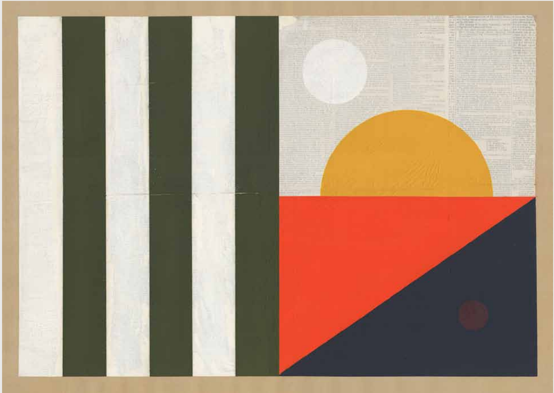
Flag for the Coming Moon , 2015, gouache and acrylic on vintage newspaper, 50cm x 70cm