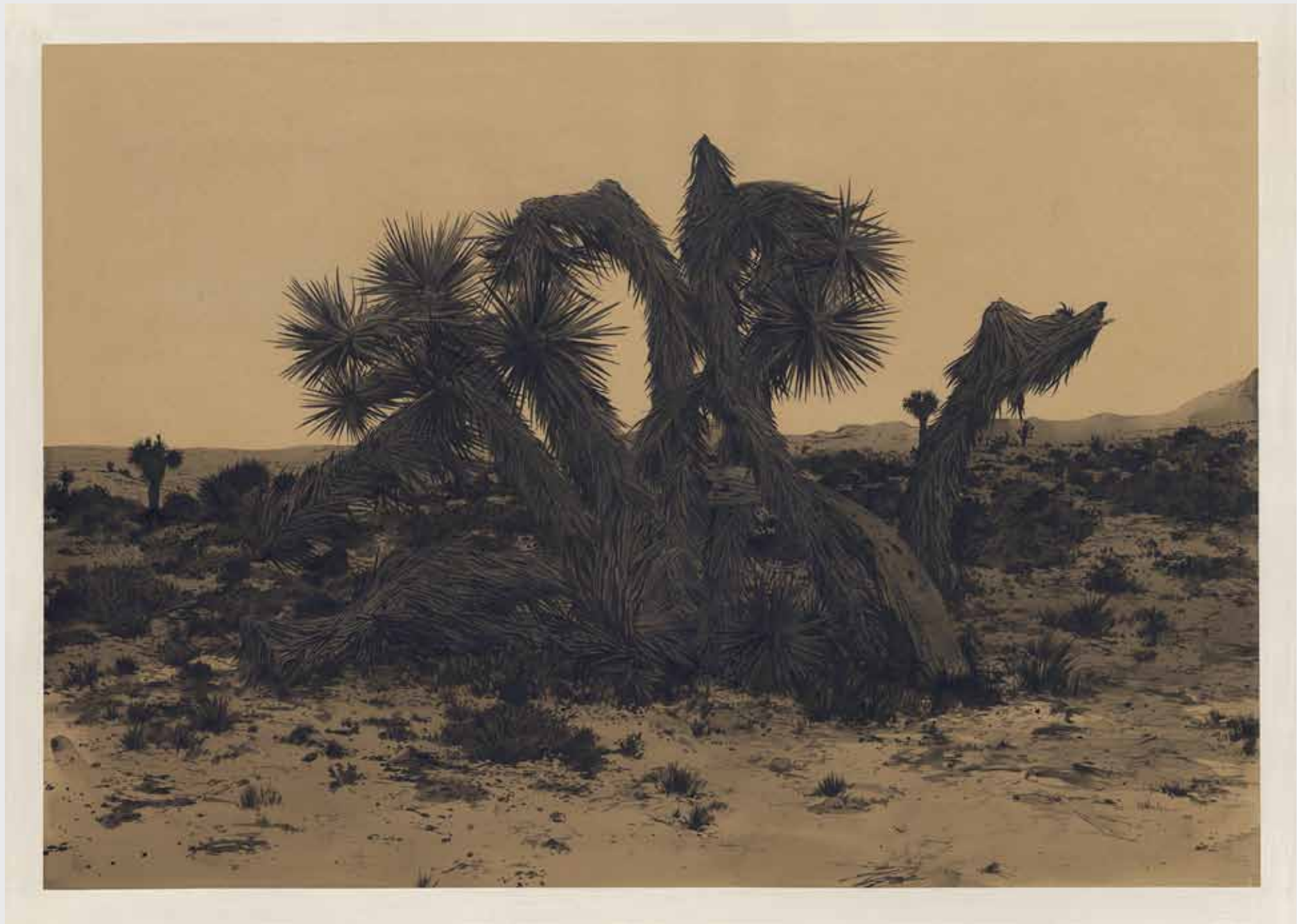
Dark Fall , 2015, acrylic and gouache on paper, 50cm x 70cm