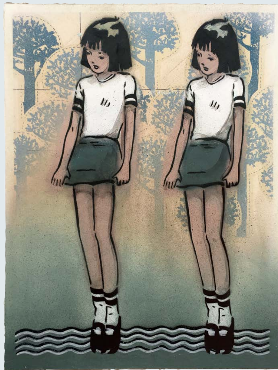
Levitationers acrylic and aerosol on paper, 40cm x 50cm, deckled edges pencil signed en verso, blind stamped bottom right, 2018