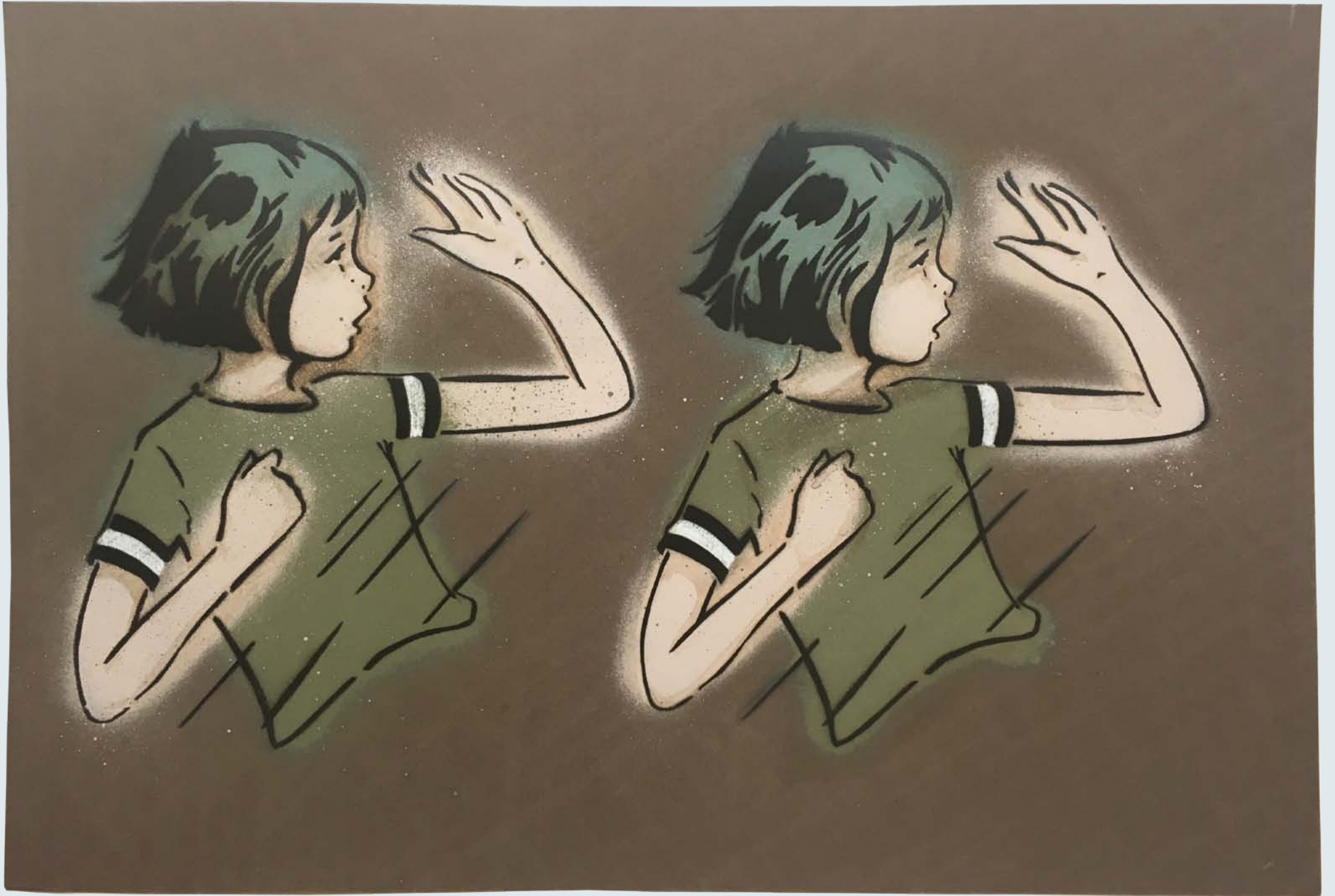
Scouts - acrylic and aerosol on paper, 70cm x 50cm, pencil signed en verso, blind stamped bottom right, 2018