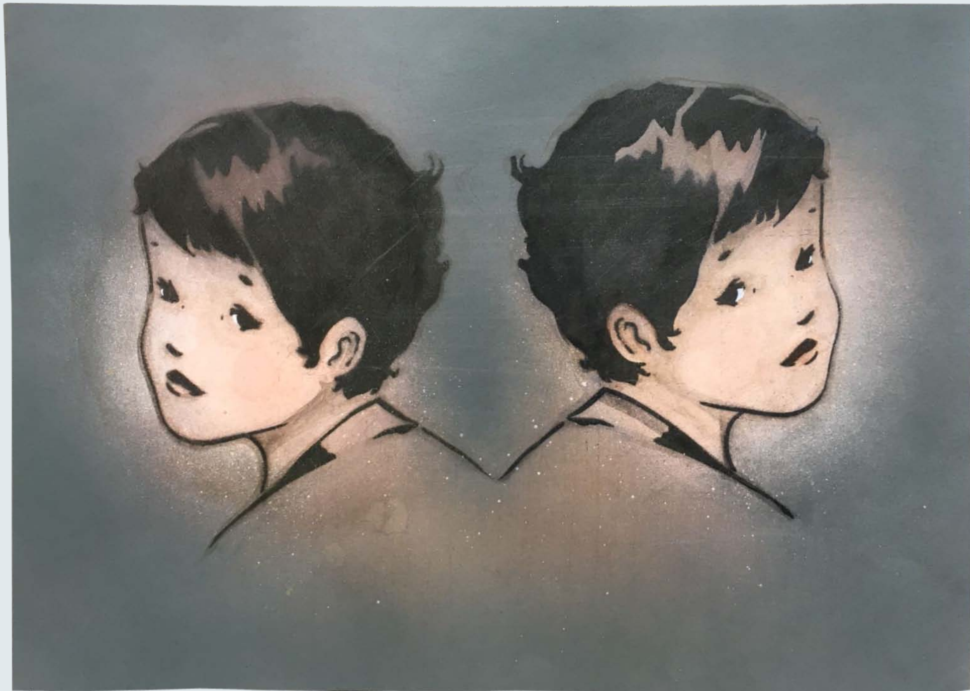
Back to Back Champions - acrylic and aerosol on paper, 70cm x 50cm, pencil signed en verso, blind stamped bottom right, 2018