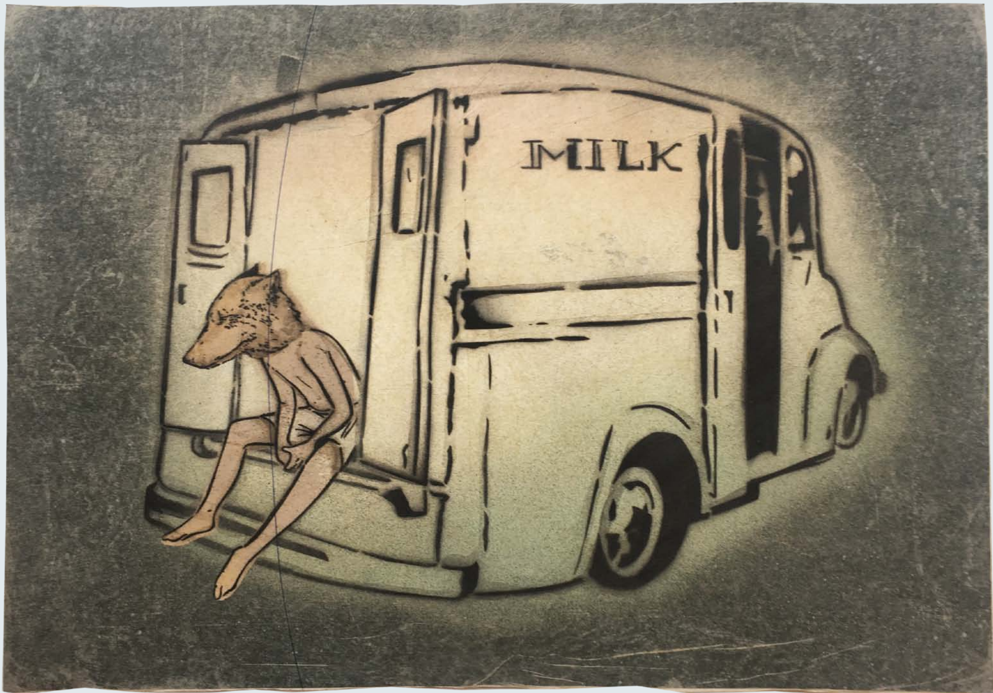
The Milkman - acrylic, aerosol and sewing pattern on paper, 70cm x 50cm, pencil signed en verso, blind stamped bottom right, 2018