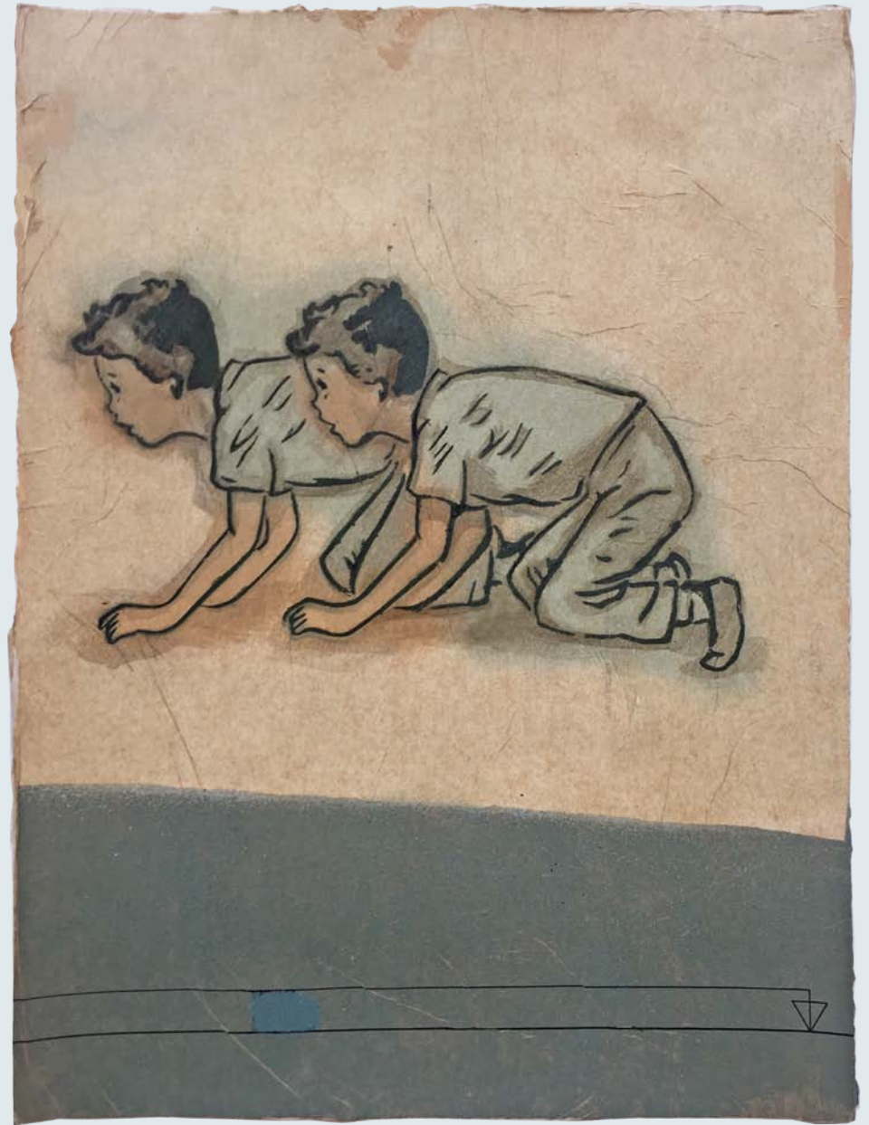
Little Sneakers (2018)

acrylic, aerosol and sewing pattern on paper, 40cm x 50cm, deckled edges pencil signed en verso, blind stamped bottom right, 2018