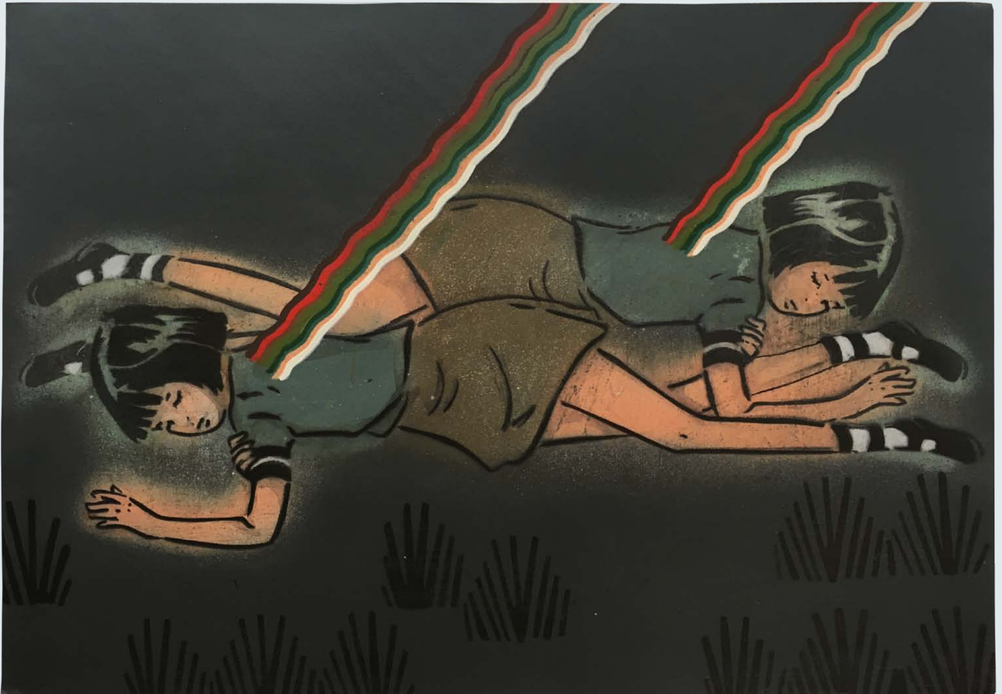
Sleeping Under Cosmic Waves - acrylic and aerosol on paper, 70cm x 50cm, pencil signed en verso, blind stamped bottom right, 2018