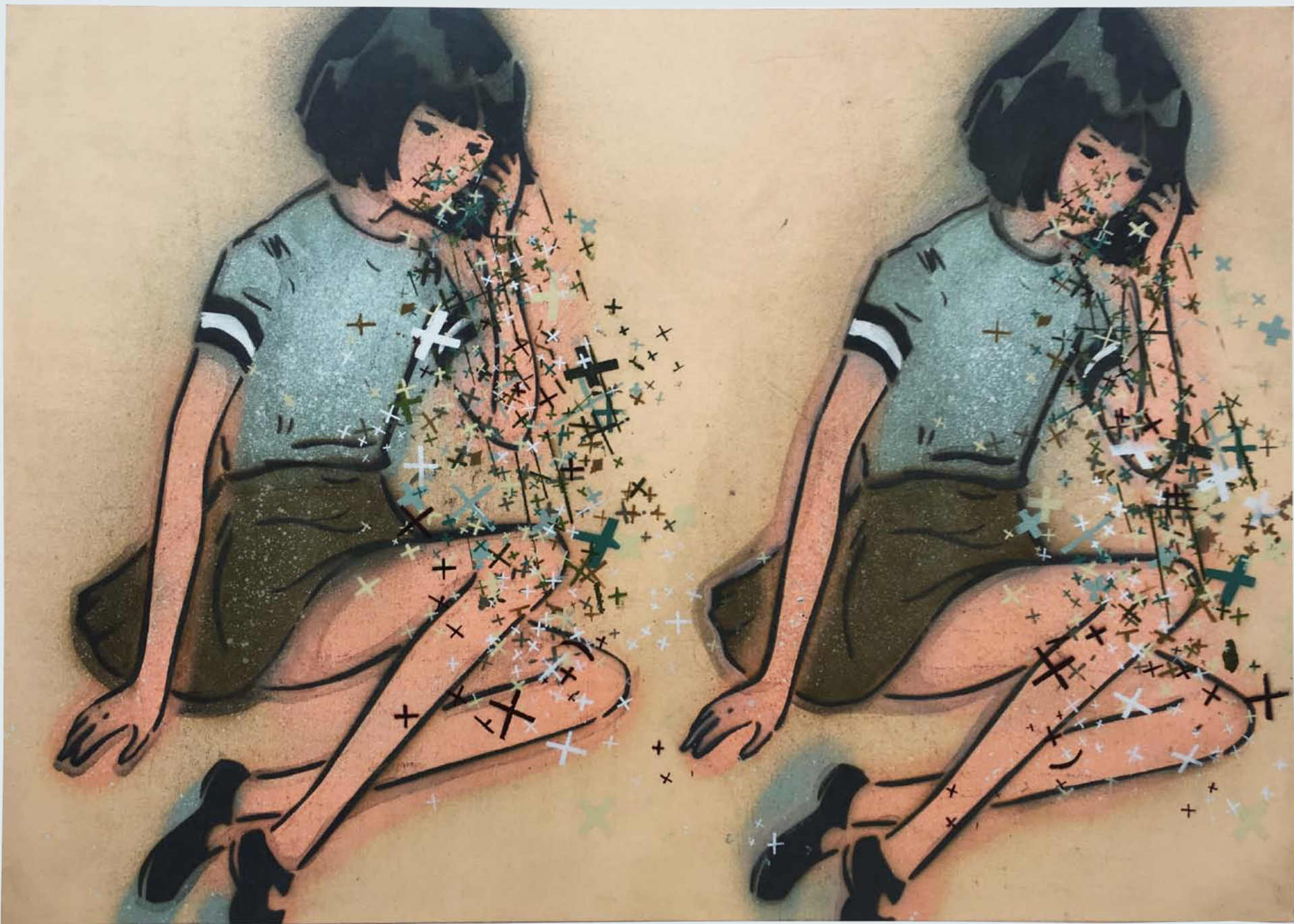
Fond Memories - acrylic and aerosol on paper, 70cm x 50cm, pencil signed en verso, blind stamped bottom right, 2018