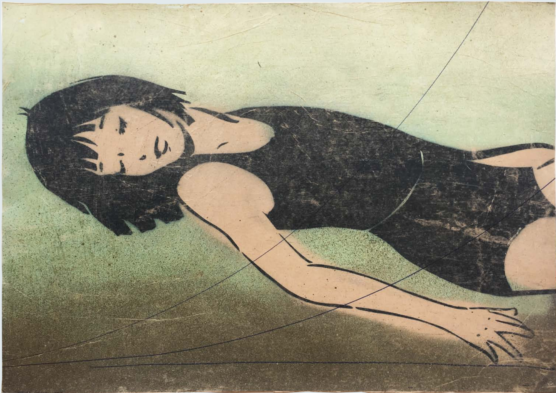
A Type Of Relaxation - acrylic, aerosol and sewing pattern on paper, 70cm x 50cm, pencil signed en verso, blind stamped bottom right, 2018