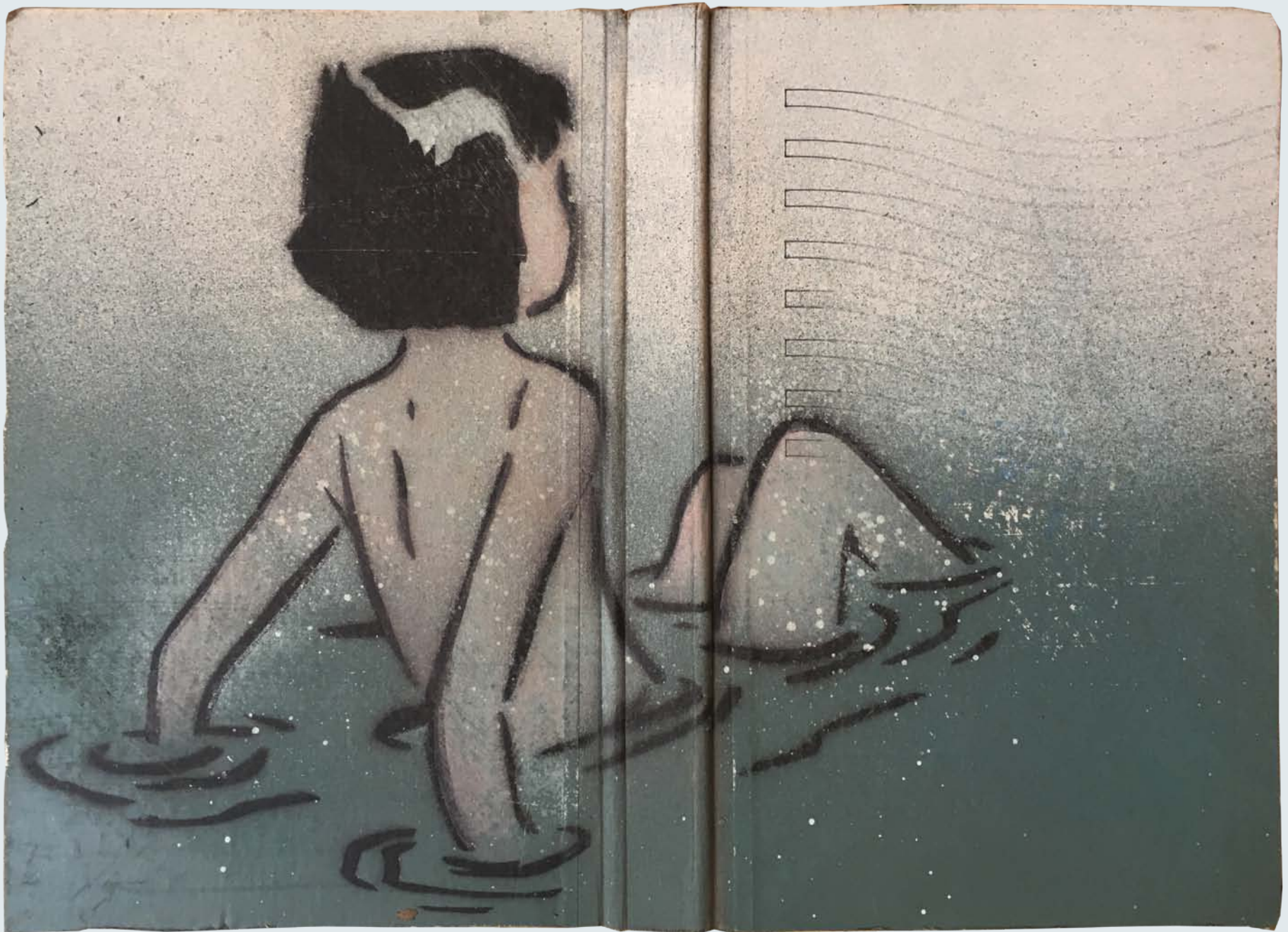
Soaking Up - acrylic and aerosol on vintage book cover, 30.6 x 23.5cm , pencil signed en verso, 2018 (shadow box frame)