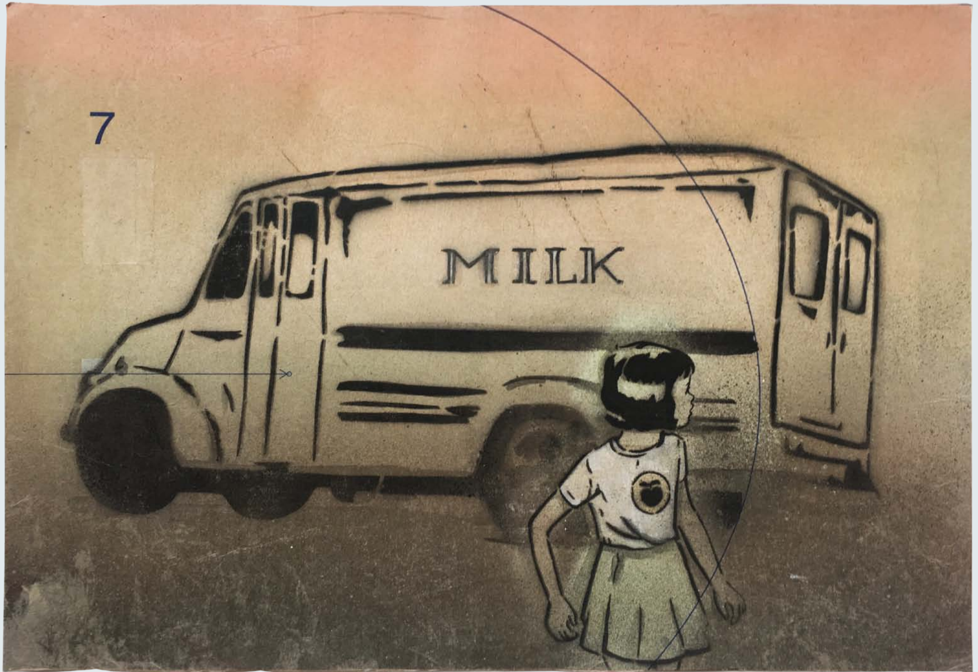
Ice Cold Milk - acrylic, aerosol, and sewing pattern on paper, 70cm x 50cm, pencil signed en verso, blind stamped bottom right, 2018