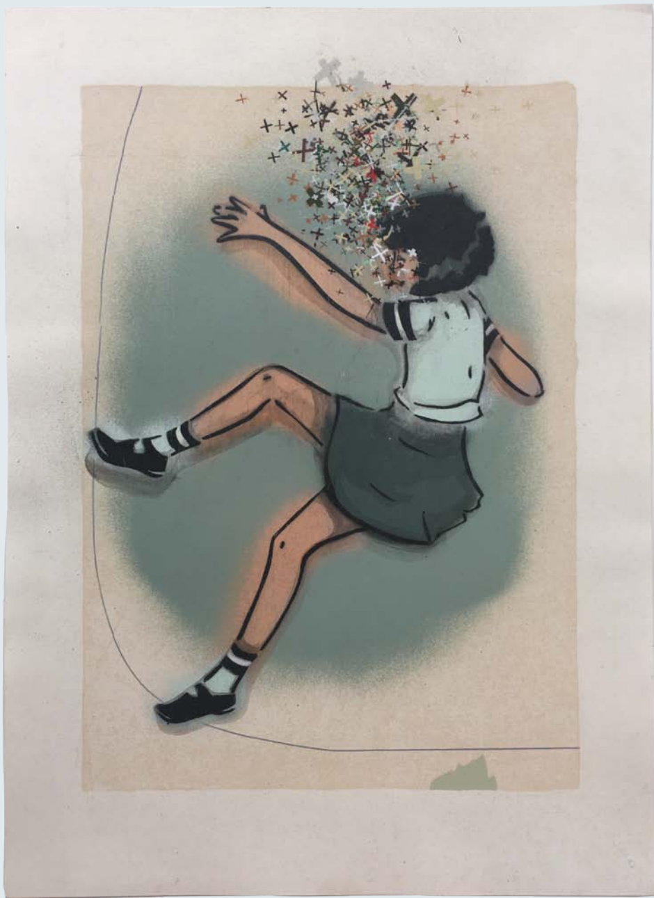
Gravity Baby acrylic and aerosol on paper, 50cm x 70cm, deckled edges pencil signed en verso, blind stamped bottom right, 2018