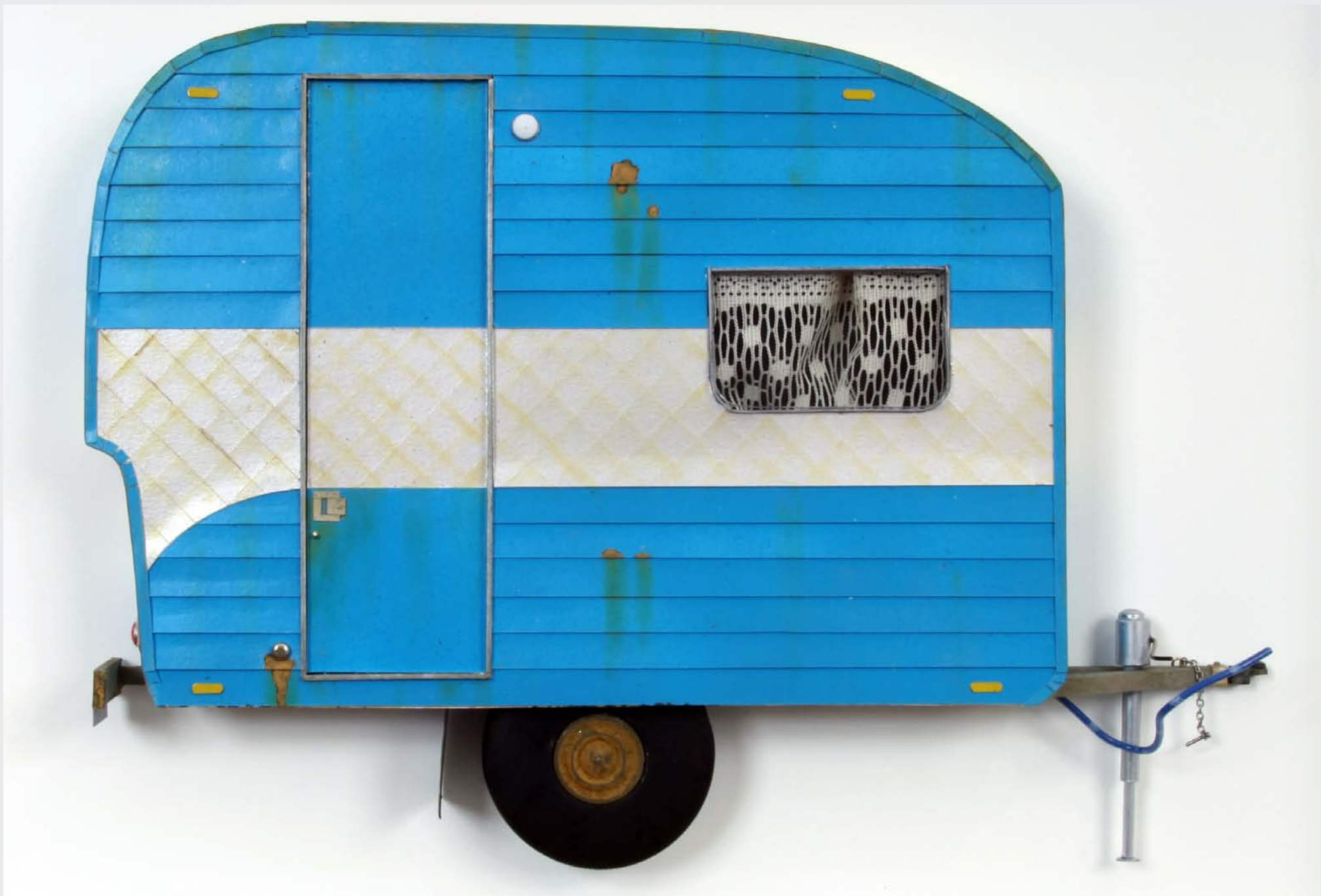
BREEZY - 2016

paper, enamel, acrylic, basswood, wire, clay, inkjet print, fabric, plastic, dry pigments, 16" x 19 7/8"