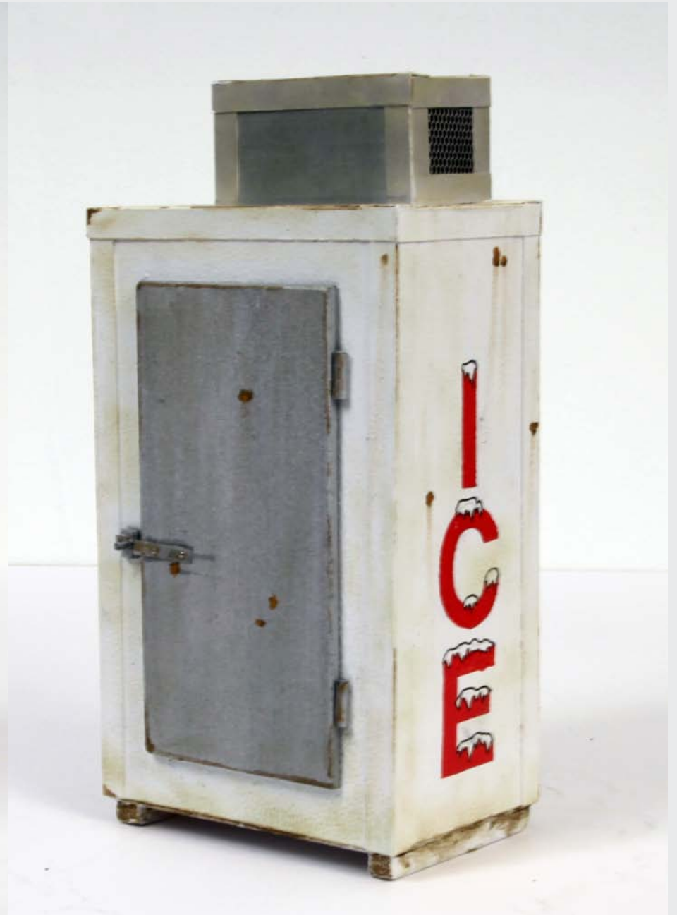
Ice Box (red), 2016, paper, enamel, acrylic, wire, dry pigments, 6 1/2" x 3 1/8" x 2 1/4"