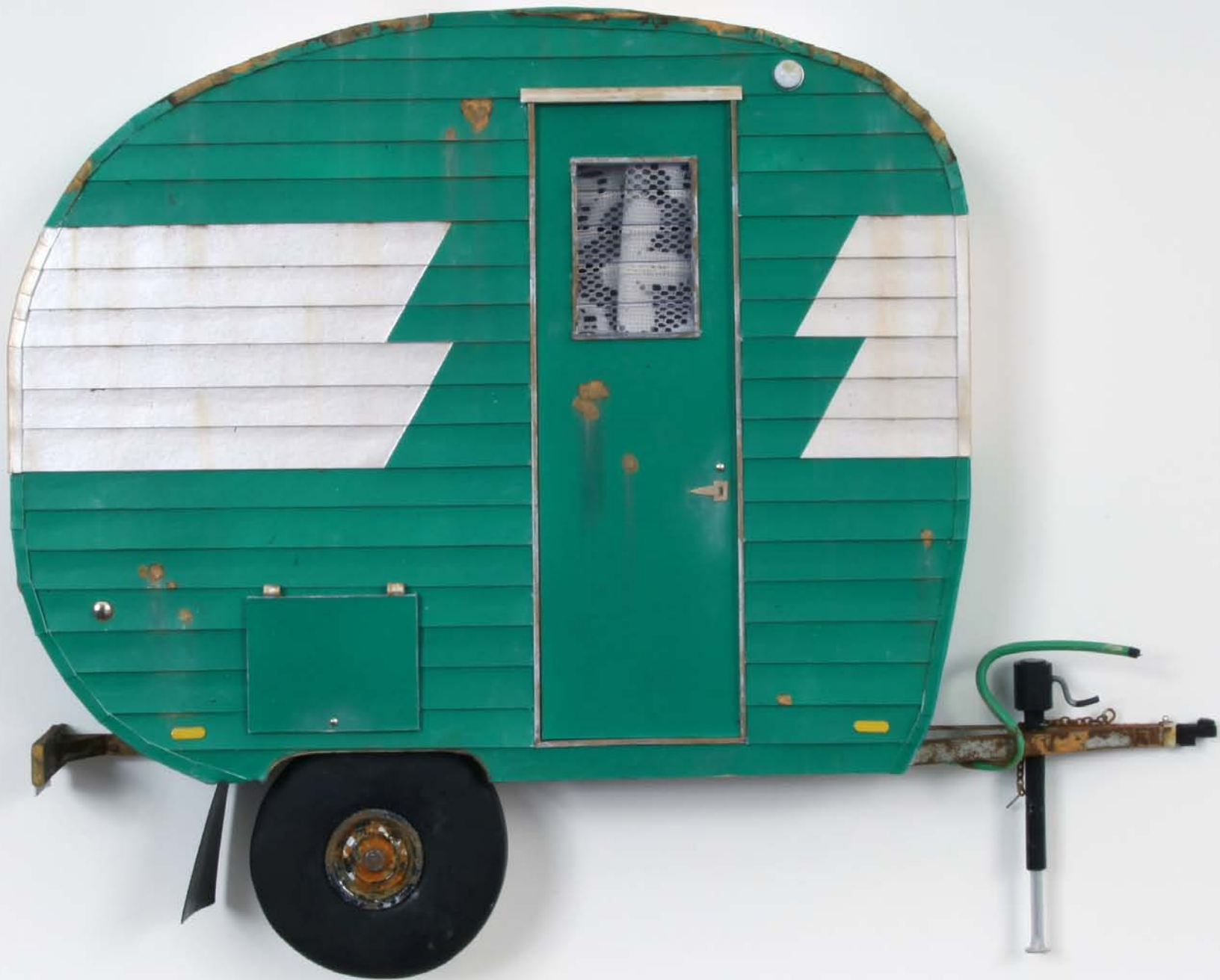
ROLLIN , 2016, paper, enamel, acrylic, basswood, wire, clay, inkjet print, fabric, plastic, dry pigments, 16" x 19"