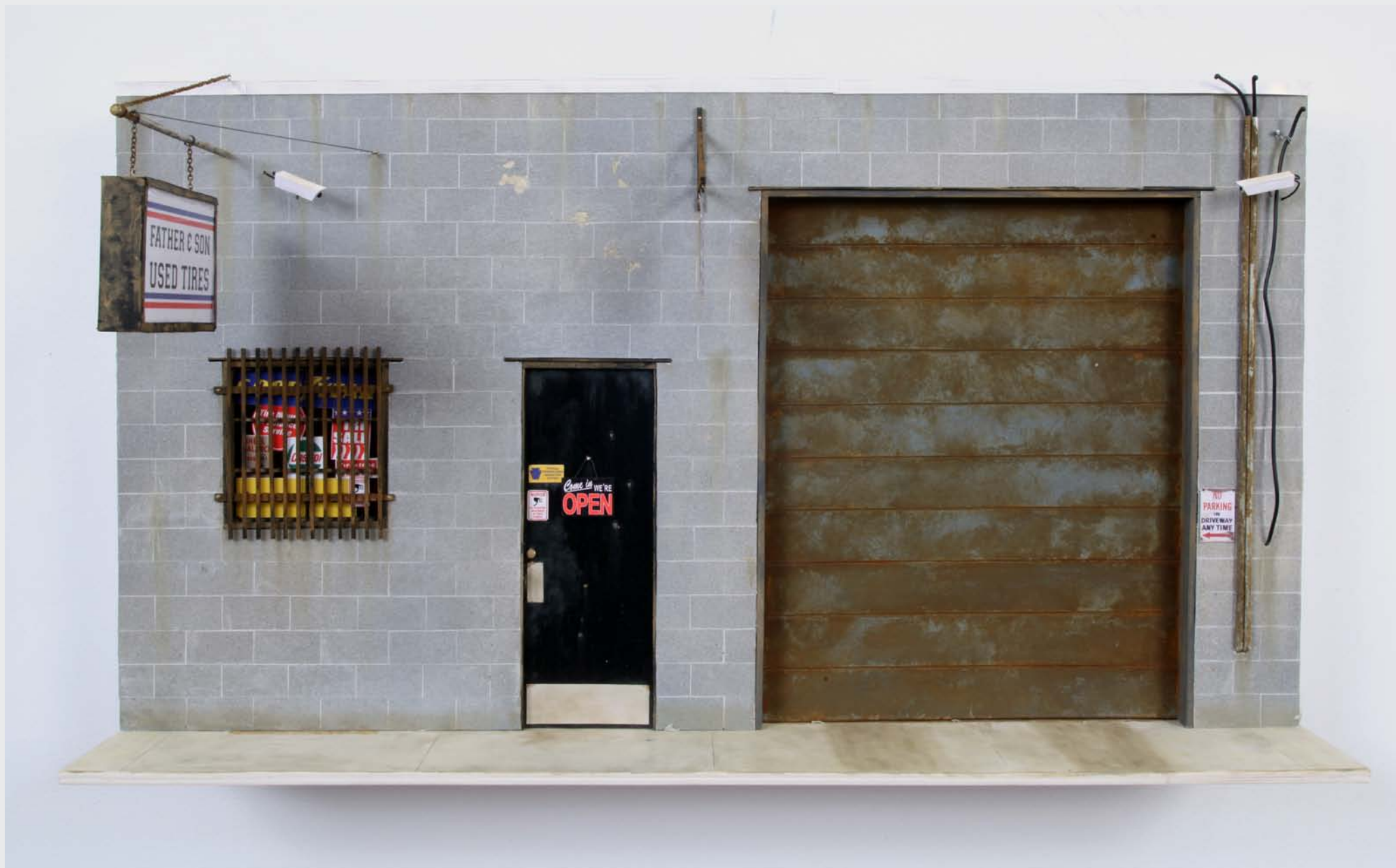
Father & Sons Used Tires – 2016, paper, enamel, acrylic, basswood, wire, clay, inkjet prints, plaster, plastic, dry pigments, 12" x 22 1/8" x 8"