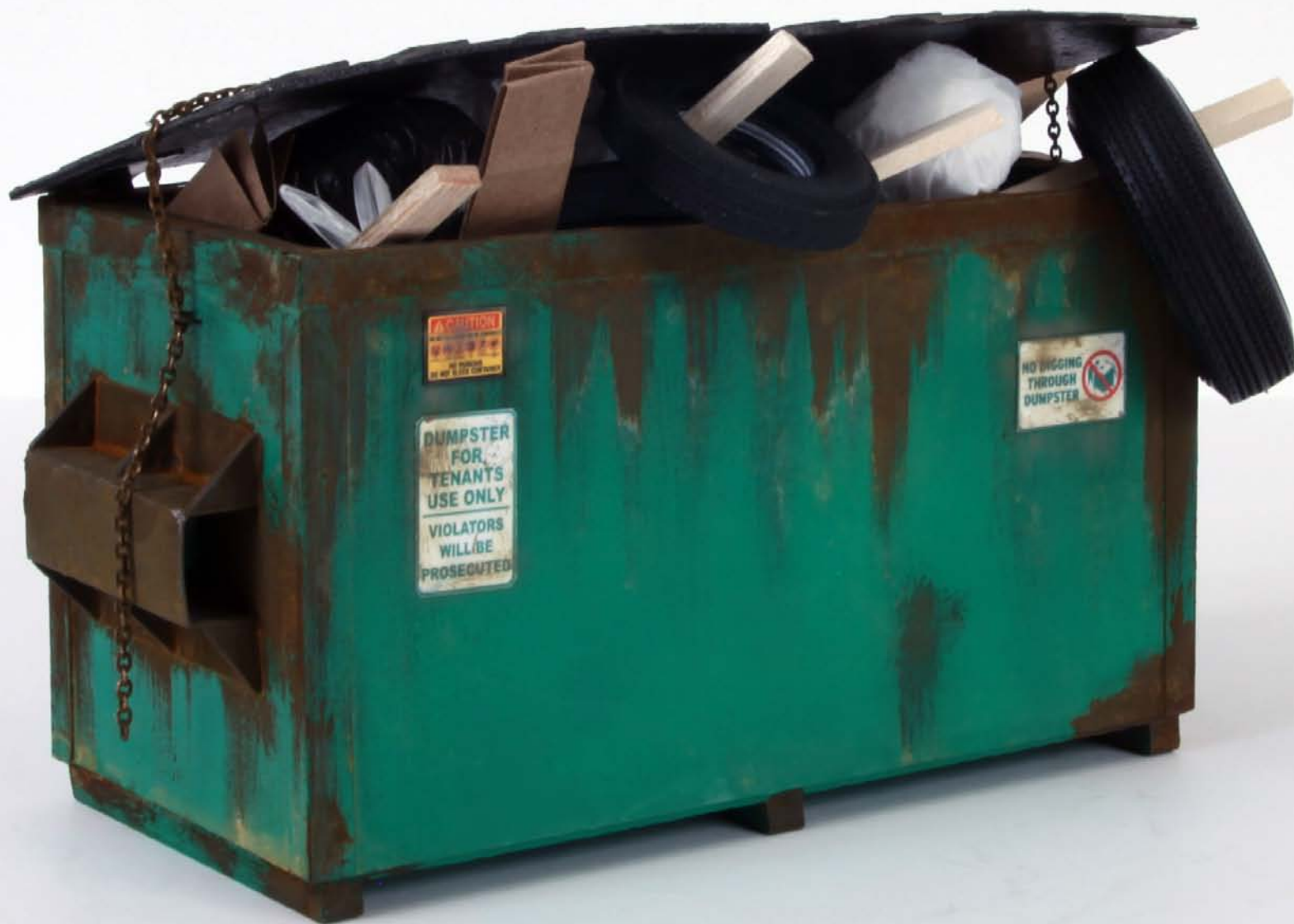
Green Dumpster (with trash) – 2016

paper, enamel, acrylic, wire, inkjet prints, basswood, toy wheels, plastic, 4 3/4" x 6 3/4" x 3 1/2"