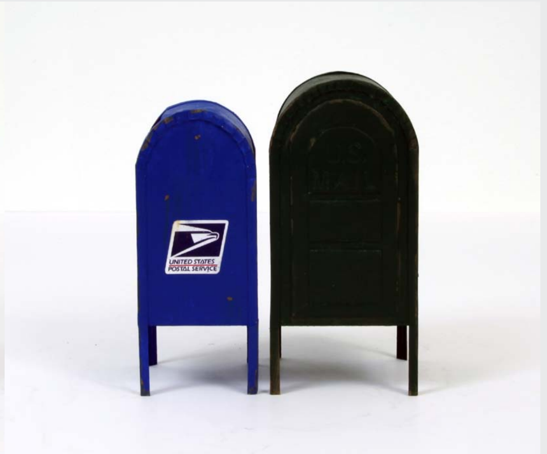
Postal Boxes, paper, enamel, acrylic, inkjet prints, dry pigments