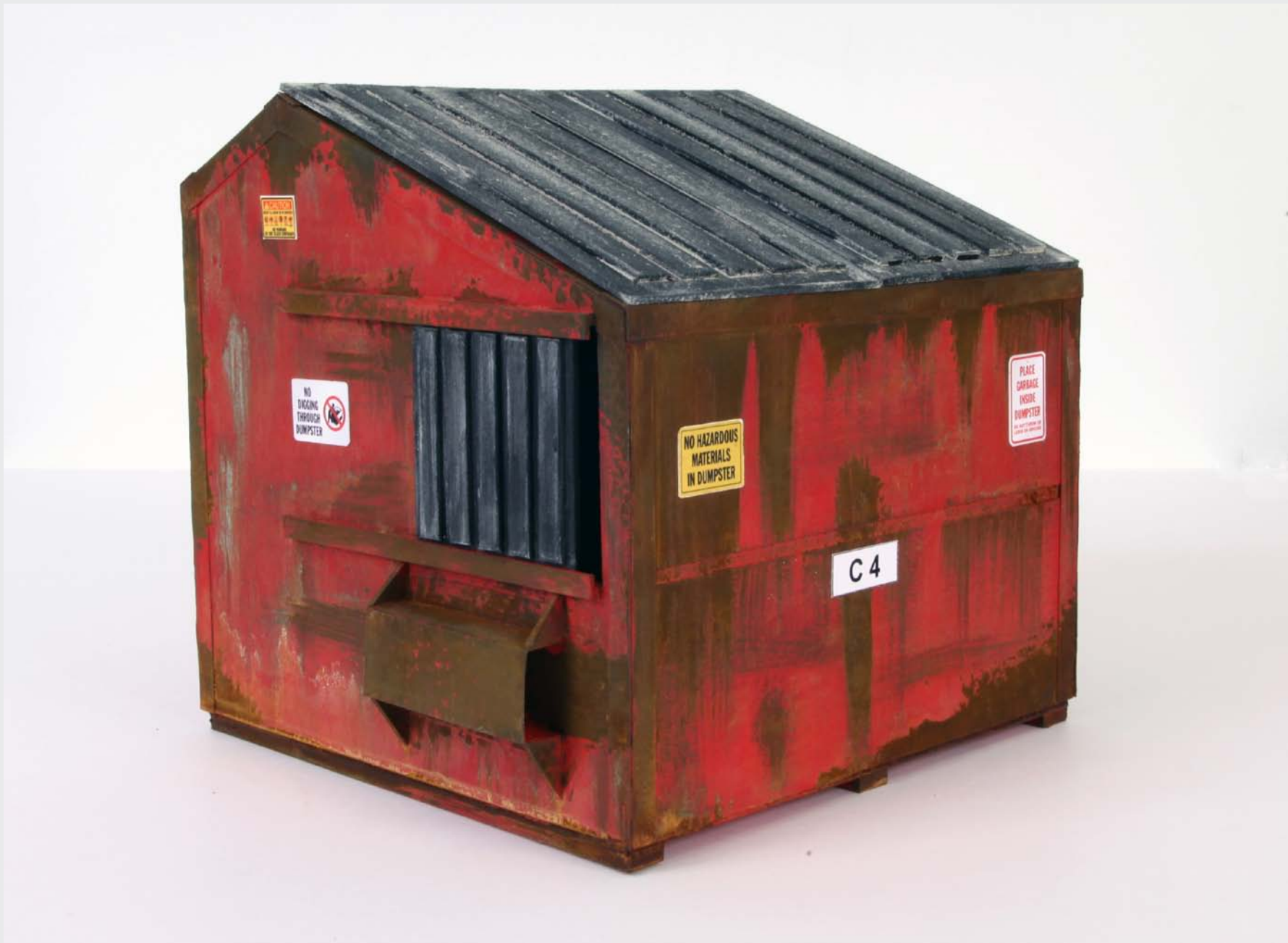
C4 - 2016 paper, enamel, acrylic, wire, inkjet prints, 6" x 6 3/4" x 6"